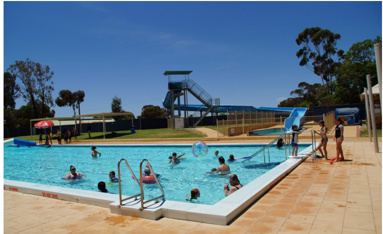
Families play in the water at the Merredin District Olympic Swimming Pool annual Australia Day Pool Party.

The Australia Day celebrations continued into the afternoon at the Merredin District Olympic Swimming Pool. From 12.00pm onwards the pool was open and free entry was granted to everyone who wanted to come and join in the pool party. A sausage sizzle lunch was provided for free, as well as face painting, games, and fun activities. Approximately 330 people came through the gate with more than 350 sausages eaten, as kids and their families enjoyed the cool water under the hot sun.