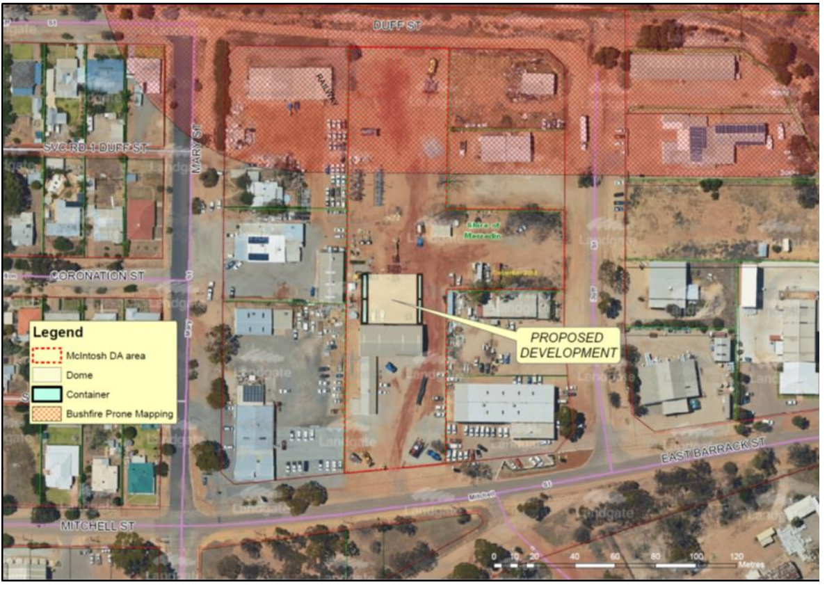
FIGURE 3 – BUSHFIRE PRONE MAPPING