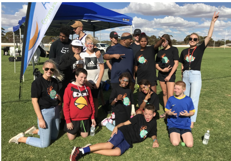
Attendees and organisers celebrating Merredin Youth Fest 2019

Finally thank you to the Men's Shed (once again) their expert barbecue cooking knowledge and skills. Youth Fest will be back in 2020.