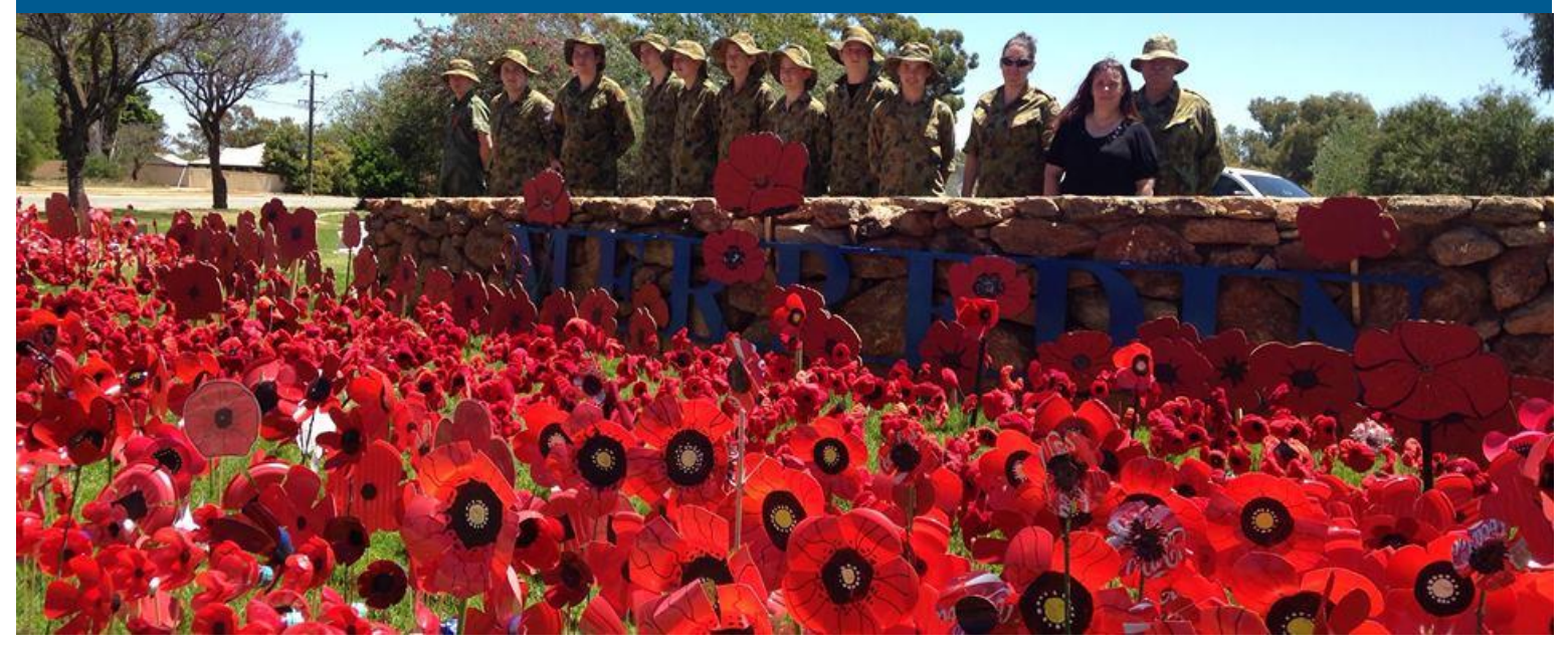
The Merredin community handmade poppies were planted again for Remembrance Day, led by the Merredin 510 Army Cadet Unit.