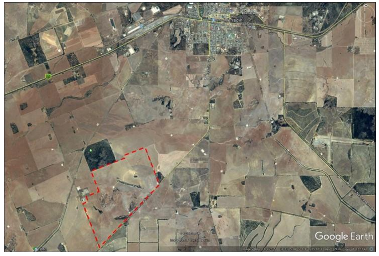
FIGURE 1 – AERIAL VIEW OF SITE