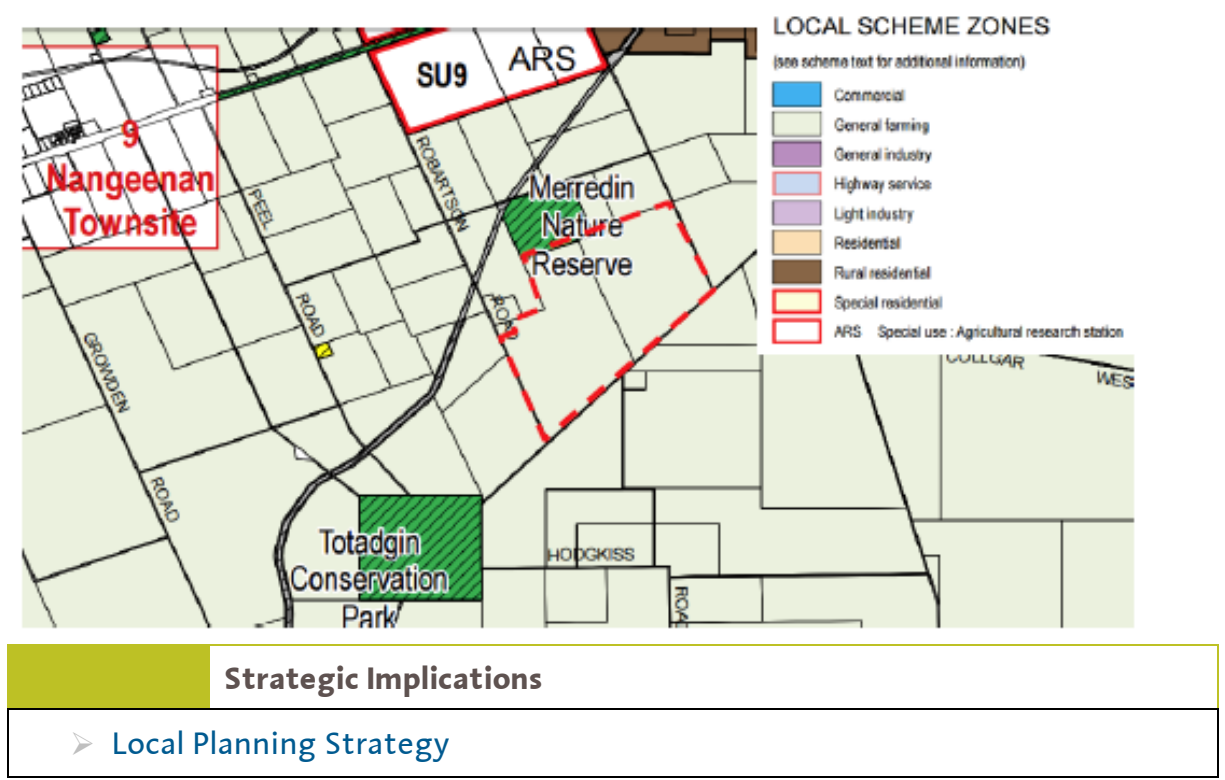
FIGURE 4 – EXTRACT FROM LOCAL PLANNING SCHEME No 6

It is considered that sub-clause b) should apply as the development is a significant facility for the Shire and district and needs to be considered by all agencies and nearby neighbours.