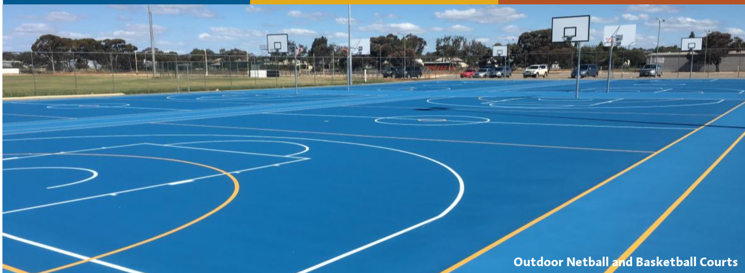
Outdoor Netball and Basketball Courts