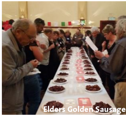
Elders Golden Sausage