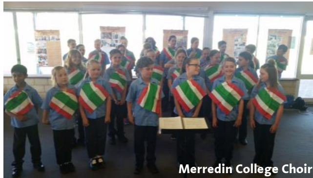
Merredin College Choir