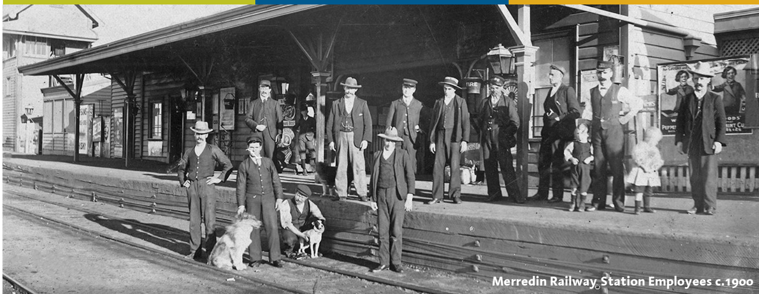
Merredin Railway Station Employees c.1900