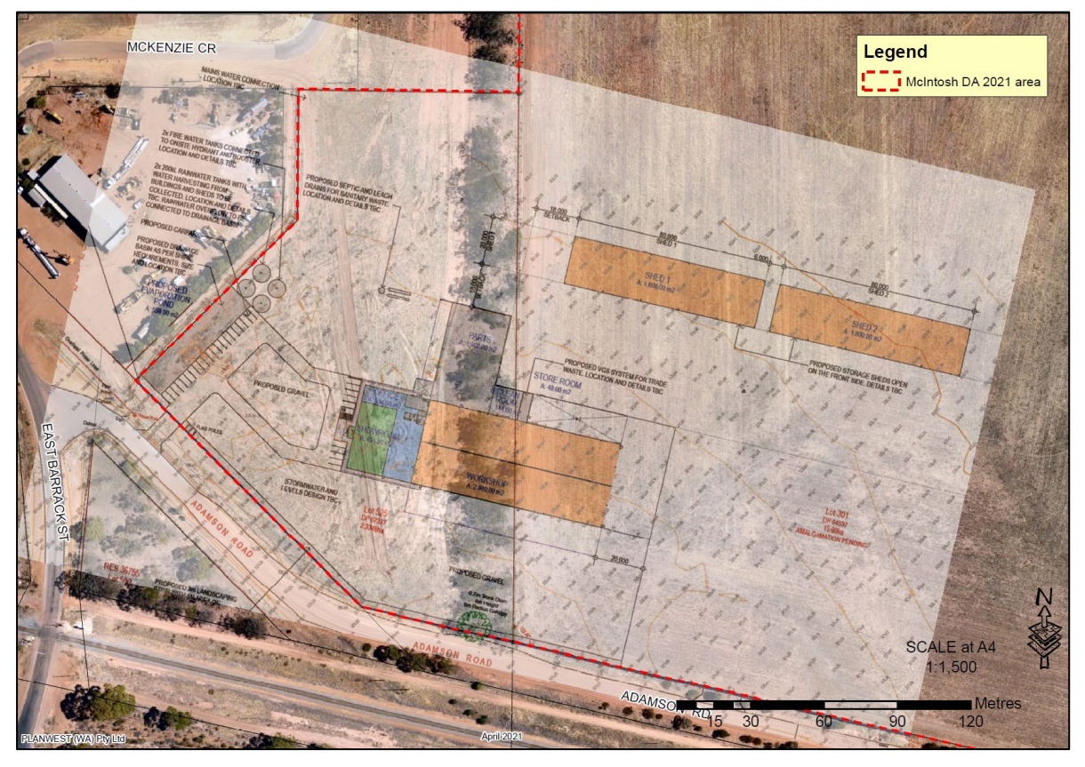
FIGURE 2 – AERIAL PHOTOGRAPH

The proposed sump abuts a 6m drainage reserve connecting McKenzie Crescent to Adamson Road. The Reserve (R 36756) is vested with DPLH for 'Drainage' purposes.