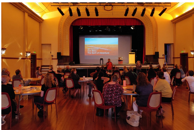
Photo: The deep dive session was held at Cummins Theatre