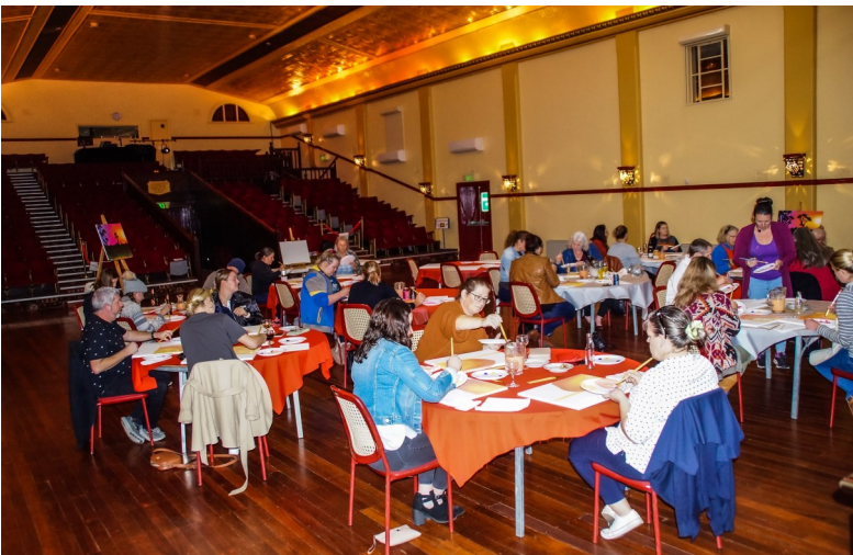
Attendees enjoying the art class at Cummins Theatre

The night was filled with laughter, bubbles, and brushes, and the end products were very creative!