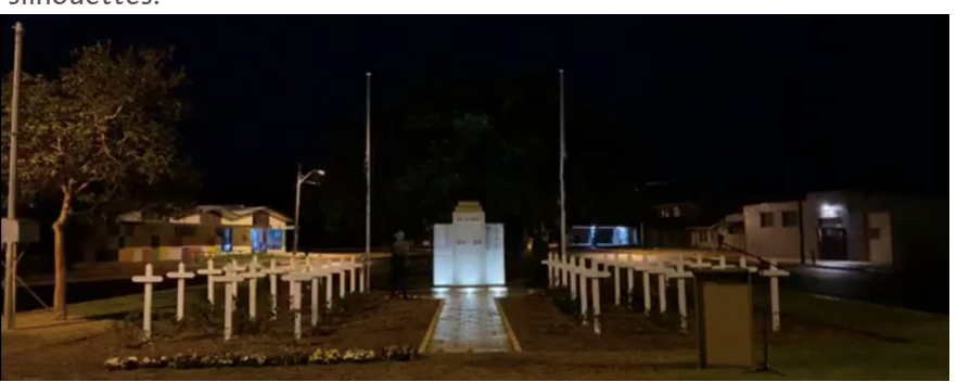
The Service was situated at the Merredin Cenotaph.

The morning was still, the only noise to be heard the patter of raindrops as they splashed on the pavement below. At 5.58am the stream went live on the Shire of Merredin Facebook page and before long nearly 200 households were watching together online, waiting in silence and looking out at the familiar white crosses and soldier silhouettes.