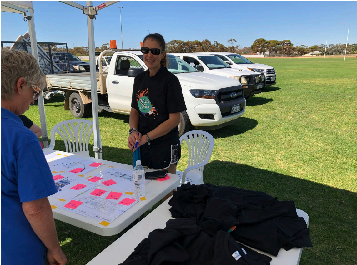
Community Engagement – Apex Park Redevelopment