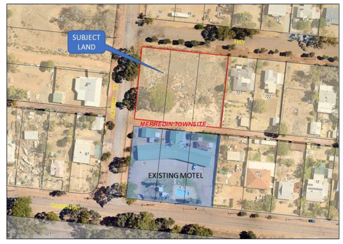
FIGURE 2 - SUBJECT LAND AND MOTEL DEVELOPMENT

The subject land is relatively flat and is mostly devoid of vegetation – other than a single tree. There are several street trees on the verges abutting the land.