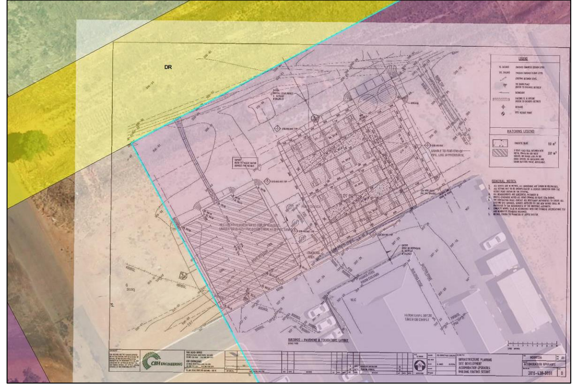
FIGURE 2 – DEVELOPMENT PROPOSAL

Figure 2 shows an enlargement of the proposal overlaid in the LPS6 map.