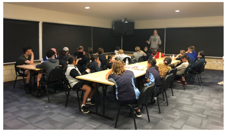
Week 1 Workshop with Cooper Creek

As well as playing sport for the past six weeks, the youth also engaged in life skills workshops which were educational, fun, and interactive. Many of the local organisations such as the police, volunteer fire department, youth officers, schoolteachers and athletes gave presentations that were both insightful and engaging for the youth. The topics included alcohol abuse, mental and physical health, lighting fires, athlete journeys, sexting and online grooming. The workshops were a great aid in developing the youths' knowledge and learning.