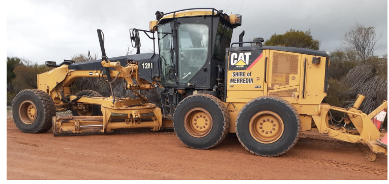
The Shire's crew are currently grading Springwell Valley Road.

As of July 2020, just over 500kms of road grading has been completed, with 380kms of road left to be completed this year.